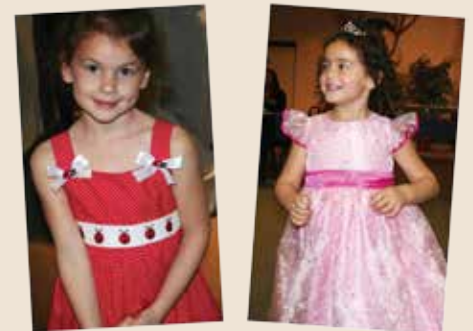
Treasure Box Kids participates in a local area fashion show in an effort to increase brand awareness.

Treasure Box Kids embodies the entrepreneurial vision shared by all clients of the UCFBIP. The company is excited to expand and grow to become a vital part of the Central Florida economy.