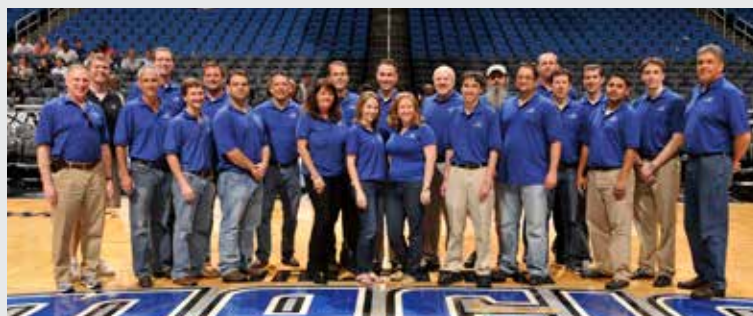
AVT Simulation staff and a guest were treated to attend an Orlando Magic game versus the Denver Nuggets in March.

AVT provides valuable learning opportunities for college and high school students by inviting local schools to tour their facilities. AVT