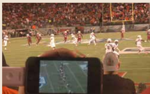
imediaReachTV™ service debut at the Russell Athletic Bowl 12/28/13 "HDTV in the Palm of your Hand" by imediaReach.com

"In a nutshell, our integrated solutions incorporate advertising and marketing with a