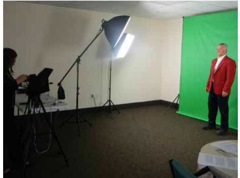
UCFBIP Video Lab includes green screen technology, and enables clients to create dynamic videos to augment their online presence.